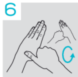
6 Rub your left and right thumbs