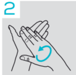
2 Spread the hand sanitiser over your hands and wrists