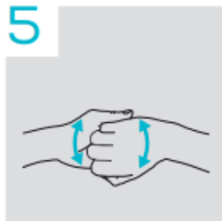
5 Rub your knuckles in your palms