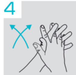
4 Rub your palms together and between your fingers