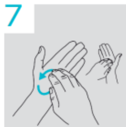
7 Rub your left and right fingertips on your palms and then around your wrists