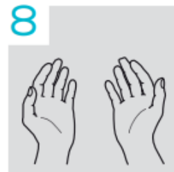
8 Keep rubbing until your hands are dry

This hand hygiene instruction card accompanies the 'Hand Hygiene' working procedure.