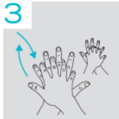
3 Rub the right palm on the back of your left hand and vice versa